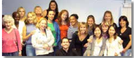
An early group photo of some Year 1 students in 2006